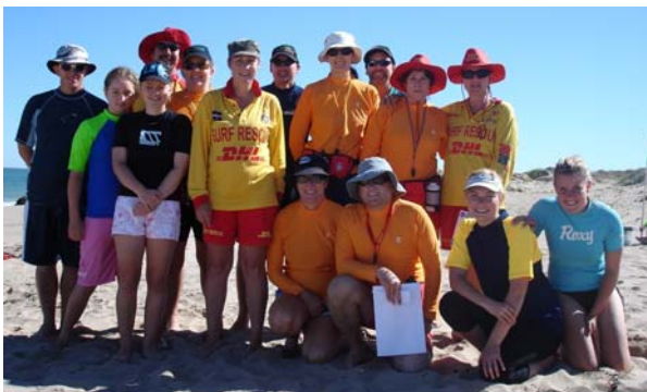
Cadets & U18’s will also help the Age Group Managers